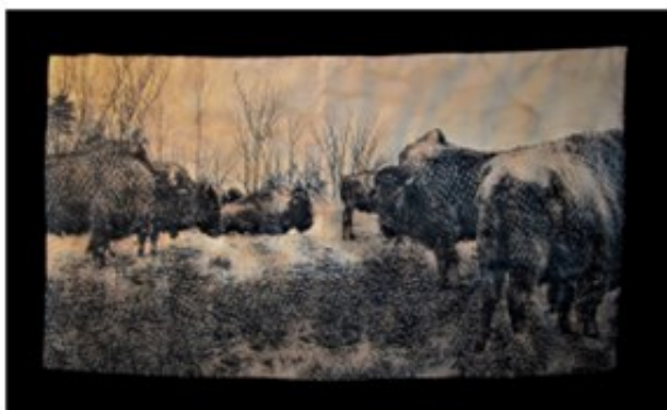
Bison Herd, mixed media on fabric, 19" x 36"

I AM BISON is a mixed-media installation that captures the bison's journey from Asia thousands of years ago to a new and hospitable home in North America, its sustenance of humans, its near extinction in a few decades by European settlers, and the remarkable rebuilding of the species. North America was tragically close to losing these majestic mammals, but through the efforts of a few far-sighted individuals, bison still thrive across the continent.